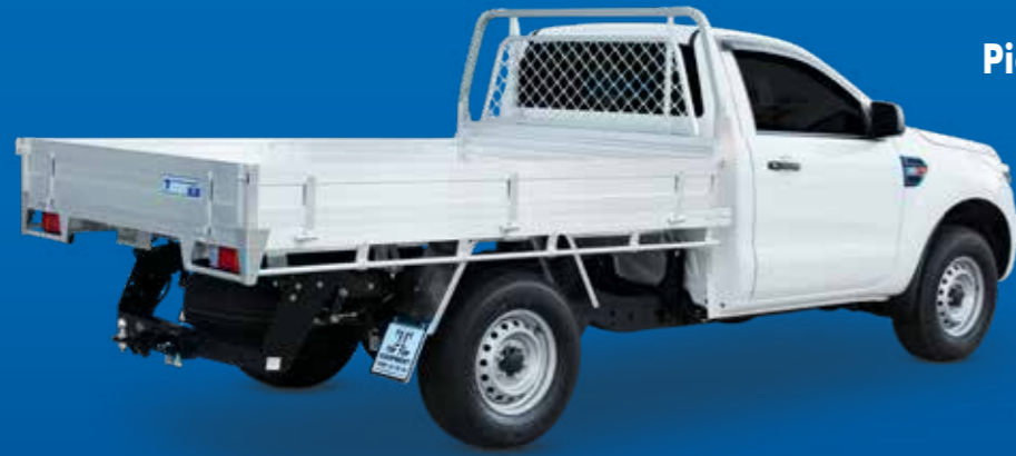
ALLOY FLEET TRAY

Pictures shown may include optional tray accessories fitted to the vehicles.