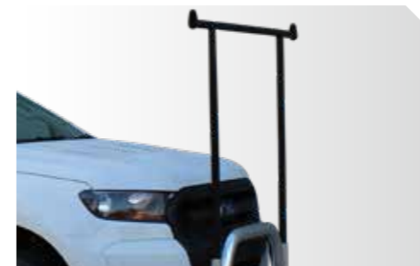
Nudge Bar & H Rack (100kg Load Rating) 76mm Nudge Bar & Black Removable H Rack