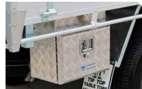
Underbody Toolbox- Alloy Checkerplate