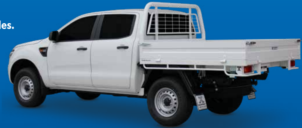
STEEL CONTRACTOR TRAY