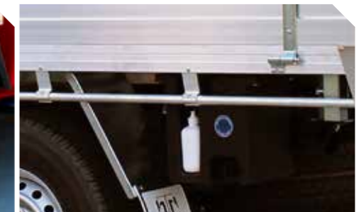
Hand Wash Unit & Soap Dispenser 15 Litres

Accessories ordered separately will incur additional freight and fitting charges.