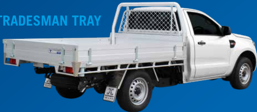
ALLOY TRADESMAN TRAY