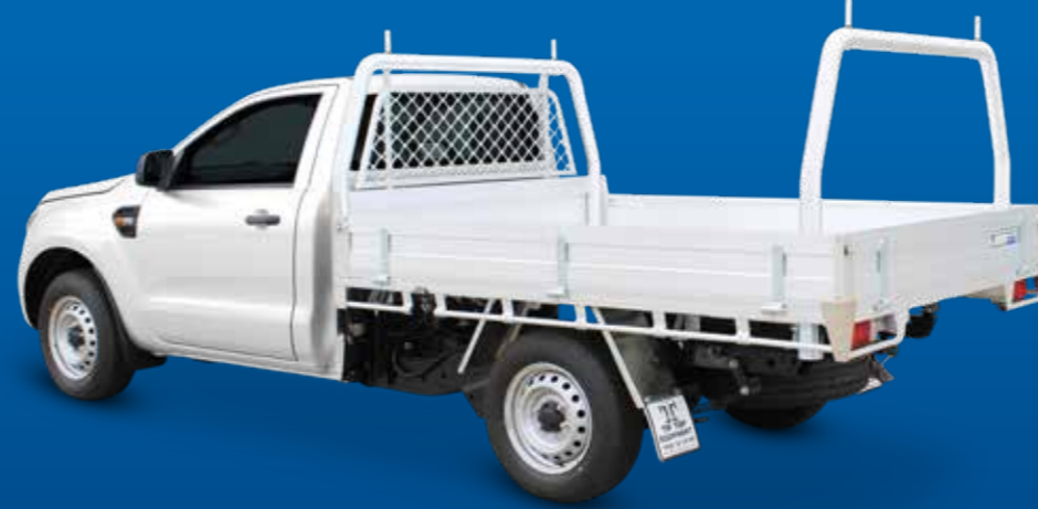
ALLOY TRADESMAN TRAY