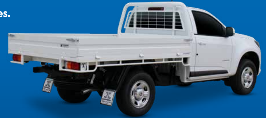
STEEL CONTRACTOR TRAY