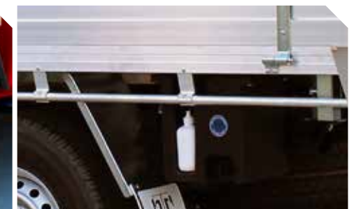
Hand Wash Unit & Soap Dispenser 15 Litres

Accessories ordered separately will incur additional freight and fitting charges.