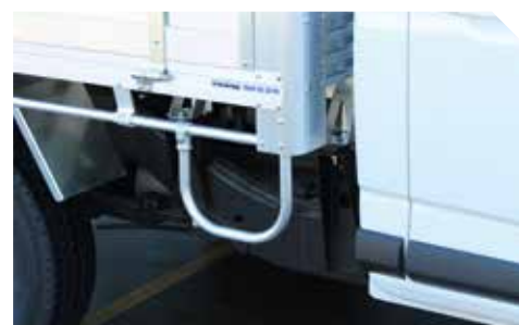
Step Kit Single- Fleet & Tradesman 25mm diameter (Not suitable for Crew Cabs)