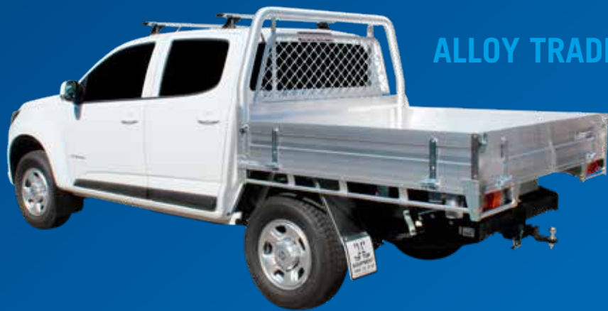
ALLOY TRADESMAN TRAY