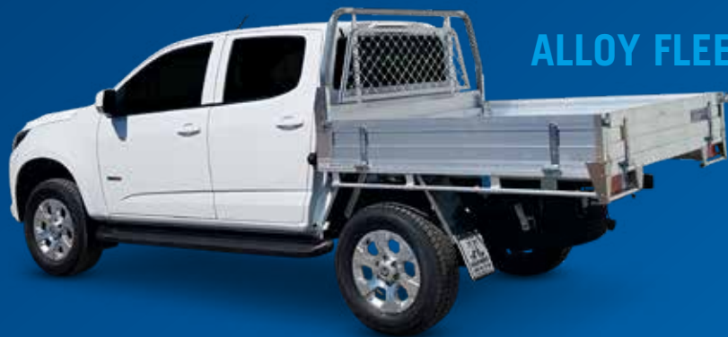
ALLOY FLEET TRAY