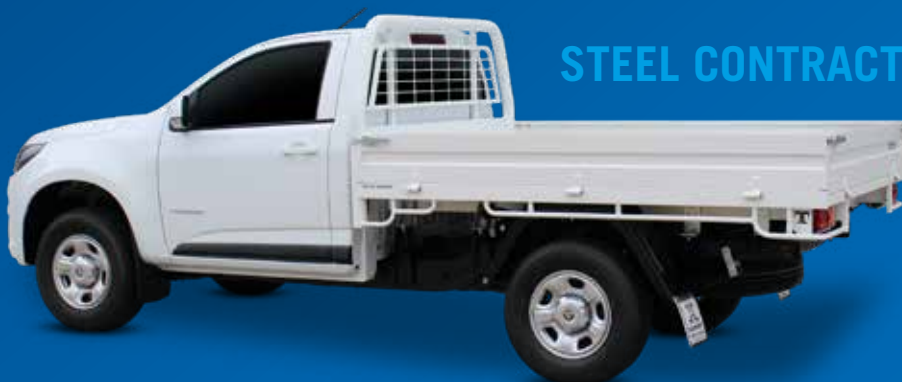
STEEL CONTRACTOR TRAY