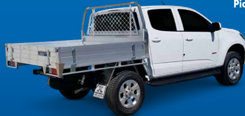
ALLOY FLEET TRAY

Pictures shown may include optional tray accessories fitted to the vehicles.