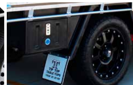
Black Poly Mudguards Black Poly Underbody Toolbox