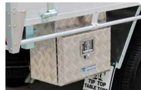
Underbody Toolbox- Alloy Checkerplate