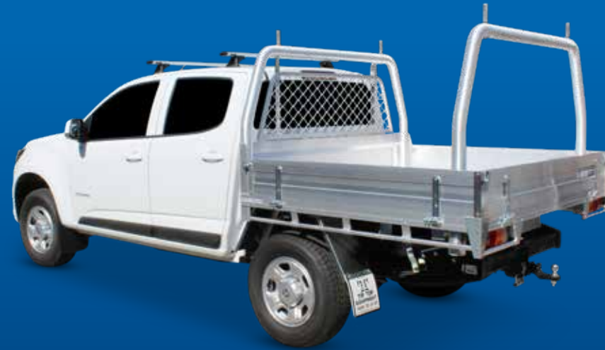
ALLOY TRADESMAN TRAY