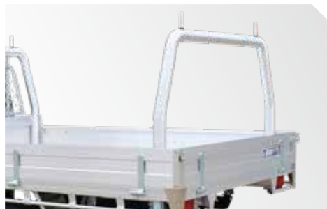
Rear Removable Rack – Tradesman Tray 76mm with 4 x 110mmH Removable Ladder Pins (2 pins on H/Board & 2 pins on Rear Rack)