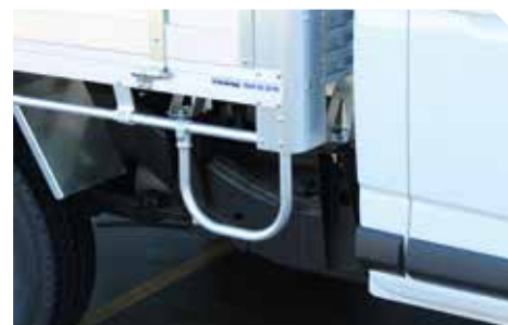
Step Kit Single- Fleet & Tradesman 25mm diameter (Not suitable for Crew Cabs)