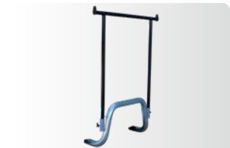
Nudge Bar & H Rack (100kg Load Rating) 76mm Nudge Bar & Black Removable H Rack