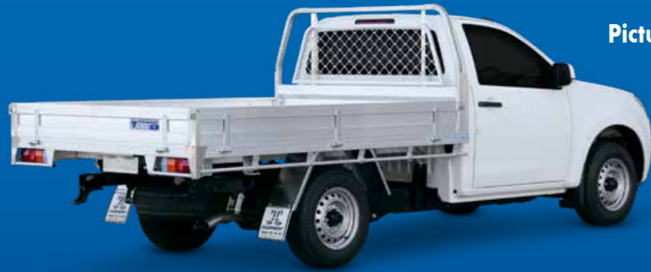
ALLOY FLEET TRAY

Pictures shown may include optional tray accessories fitted to the vehicles.