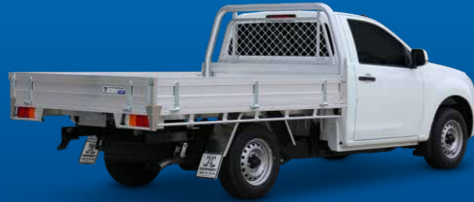
ALLOY TRADESMAN TRAY