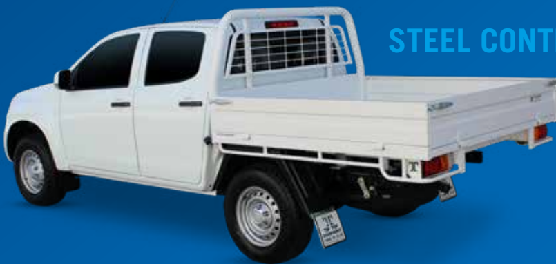
STEEL CONTRACTOR TRAY