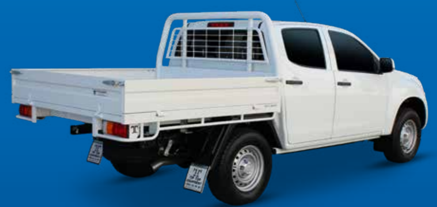
STEEL CONTRACTOR TRAY