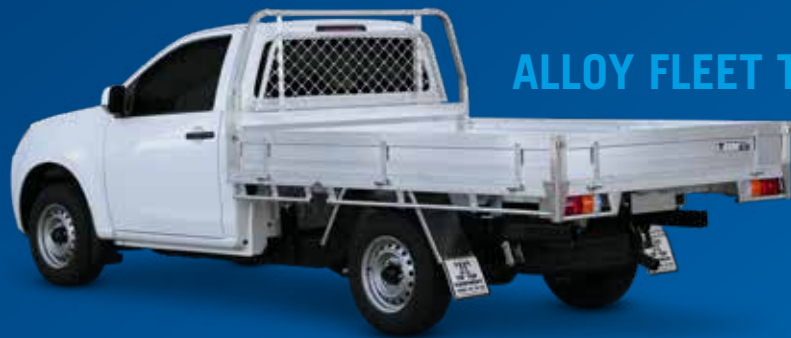
ALLOY FLEET TRAY