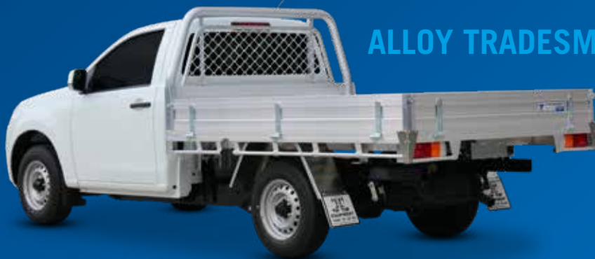
ALLOY TRADESMAN TRAY