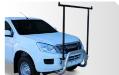
Nudge Bar & H Rack (100kg Load Rating) 76mm Nudge Bar & Black Removable H Rack