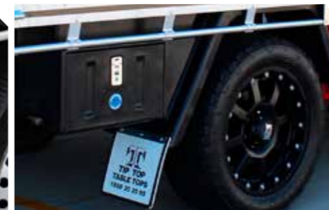
Black Poly Mudguards Black Poly Underbody Toolbox