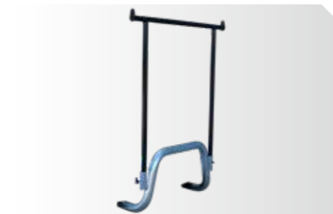
Nudge Bar & H Rack (100kg Load Rating) 76mm Nudge Bar & Black Removable H Rack