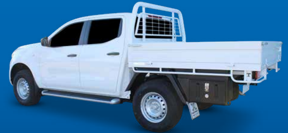
STEEL CONTRACTOR TRAY