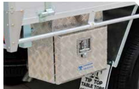
Underbody Toolbox- Alloy Checkerplate