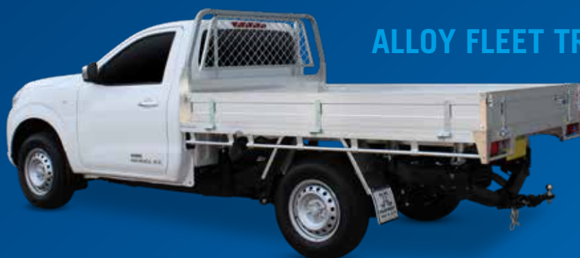
ALLOY FLEET TRAY