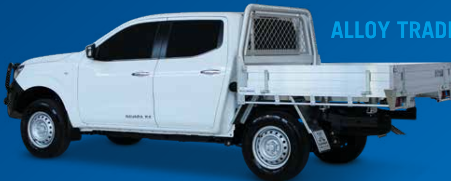
ALLOY TRADESMAN TRAY