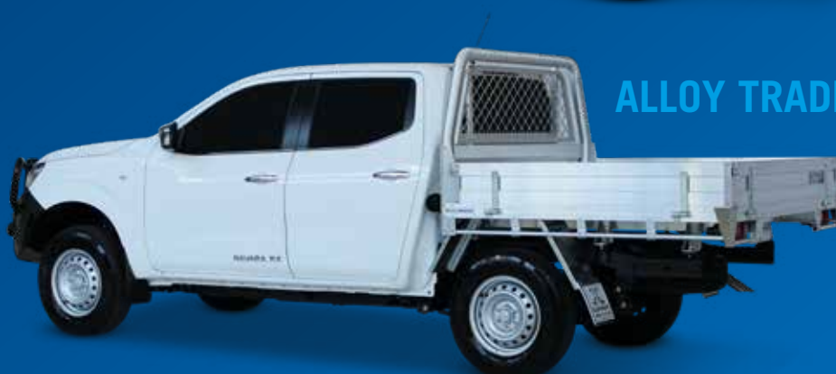
ALLOY TRADESMAN TRAY