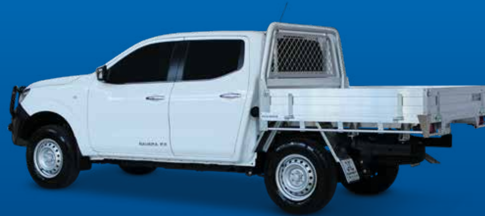
ALLOY TRADESMAN TRAY