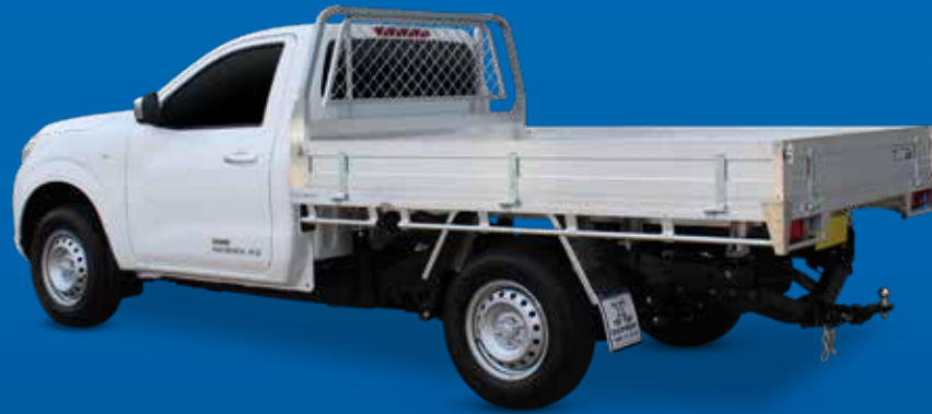
ALLOY FLEET TRAY

Pictures shown may include optional tray accessories fitted to the vehicles.