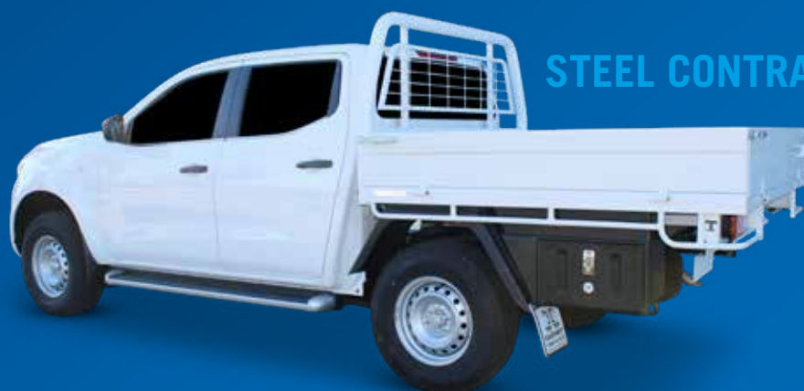
STEEL CONTRACTOR TRAY