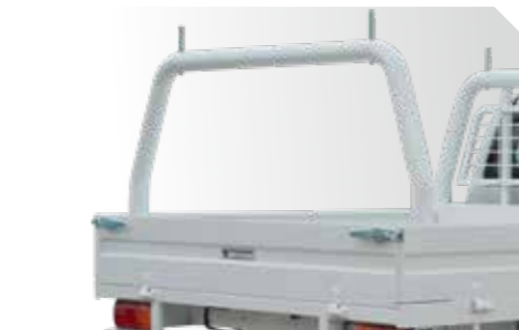
Rear Removable Rack – Contractor Tray 76mm with 4 x 110mmH Removable Ladder Pins (2 pins on H/Board & 2 pins on Rear Rack)