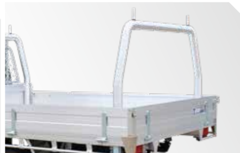
Rear Removable Rack – Tradesman Tray 76mm with 4 x 110mmH Removable Ladder Pins (2 pins on H/Board & 2 pins on Rear Rack)