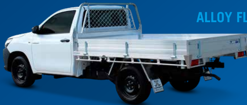
ALLOY FLEET TRAY