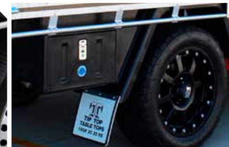
Black Poly Mudguards Black Poly Underbody Toolbox