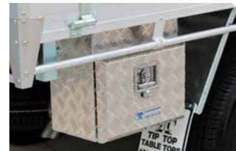
Underbody Toolbox- Alloy Checkerplate