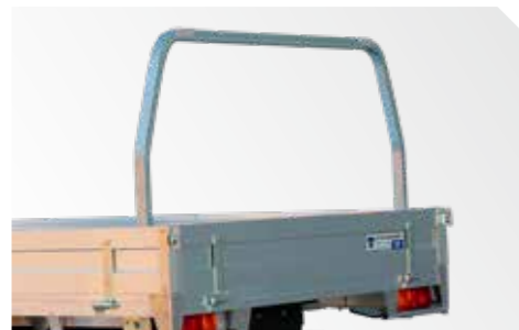
Rear Removable Rack- Fleet tray 40x40 with Folding Pins