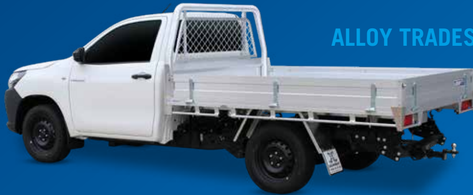
ALLOY TRADESMAN TRAY