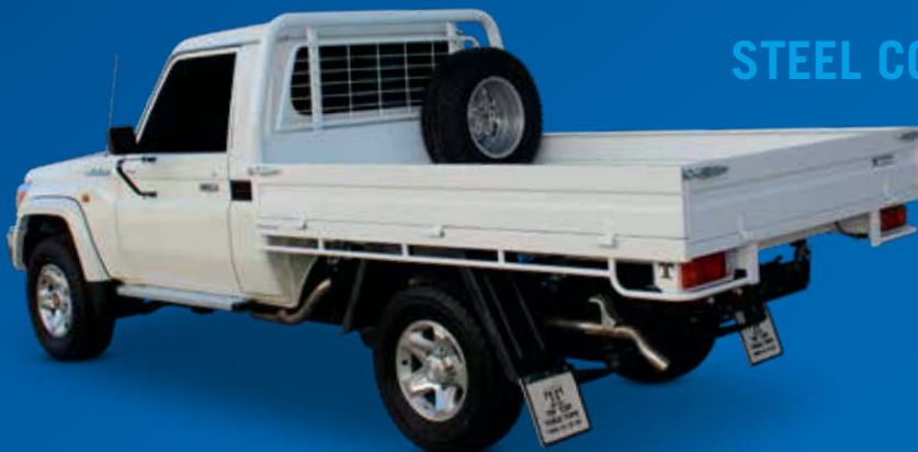
STEEL CONTRACTOR TRAY