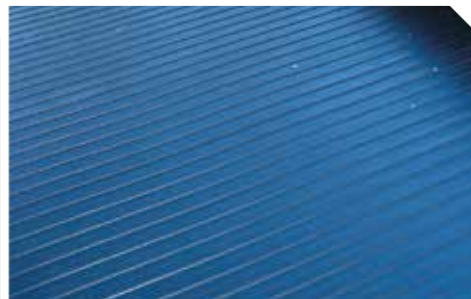
Rubber Tray Mat Heavy Duty - 6mm