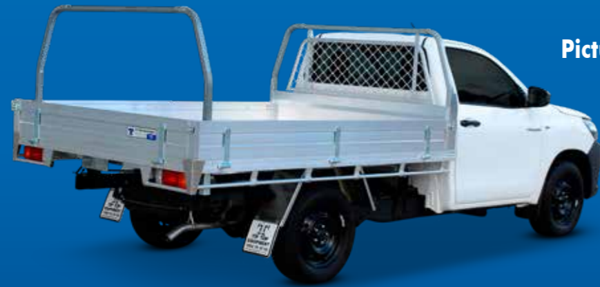
ALLOY FLEET TRAY

Pictures shown may include optional tray accessories fitted to the vehicles.