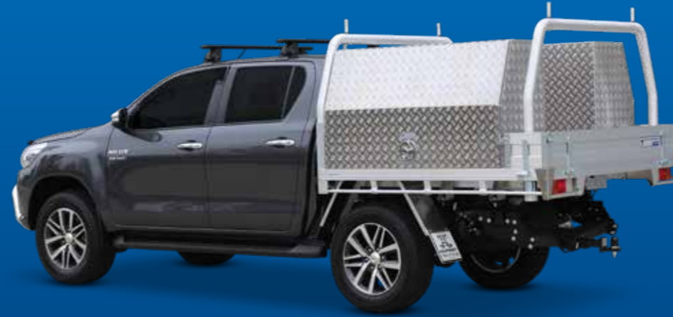
ALLOY TRADESMAN TRAY