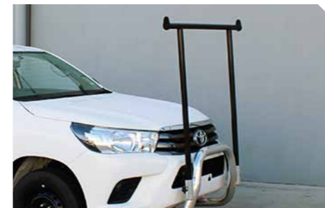
Nudge Bar & H Rack (100kg Load Rating) 76mm Nudge Bar & Black Removable H Rack