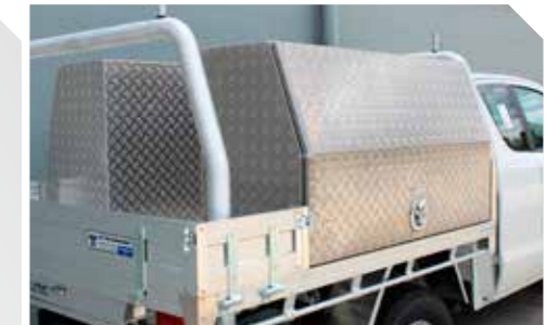
Angled Alloy C/Plate Toolbox with Shelf 1425mm L x 850mm H x 600mm W