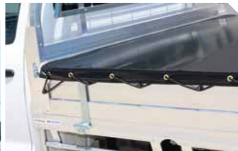
Tonneau Cover or Tonneau Cover Trimmed around Rear Rack - Heavy Duty PVC