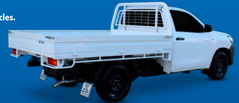
STEEL CONTRACTOR TRAY

* Fitting within 3 business days available in dealerships in Sydney Metro & Selected Areas only. Orders must be received before 9am. Excludes the issues out of the control of Tip Top Equipment. POA for Supply Only to regional areas.