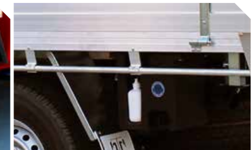
Hand Wash Unit & Soap Dispenser 15 Litres

Undertray spare wheel storage also available (Landcruiser). Accessories ordered separately will incur additional freight and fitting charges.